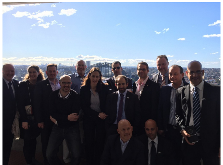
July 2016: First Israel-Australia Cyber Dialogue